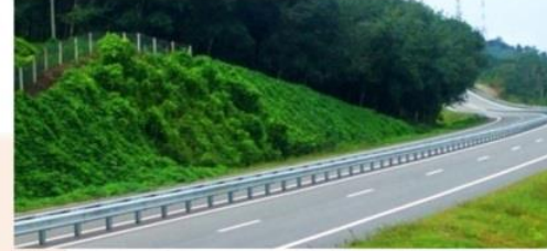
Southern Express Way