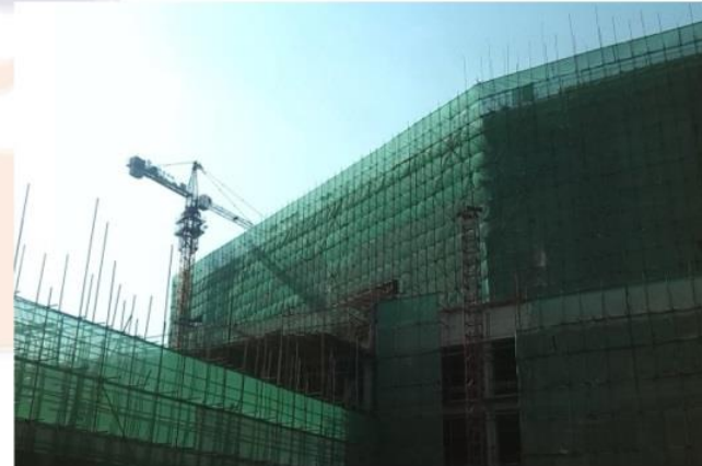
Defiance Hospital Project