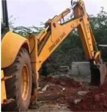
Rider Main Galle Road to Aponsu Avenue