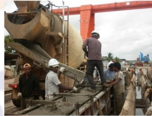
Pre Cast Yard (MCC)