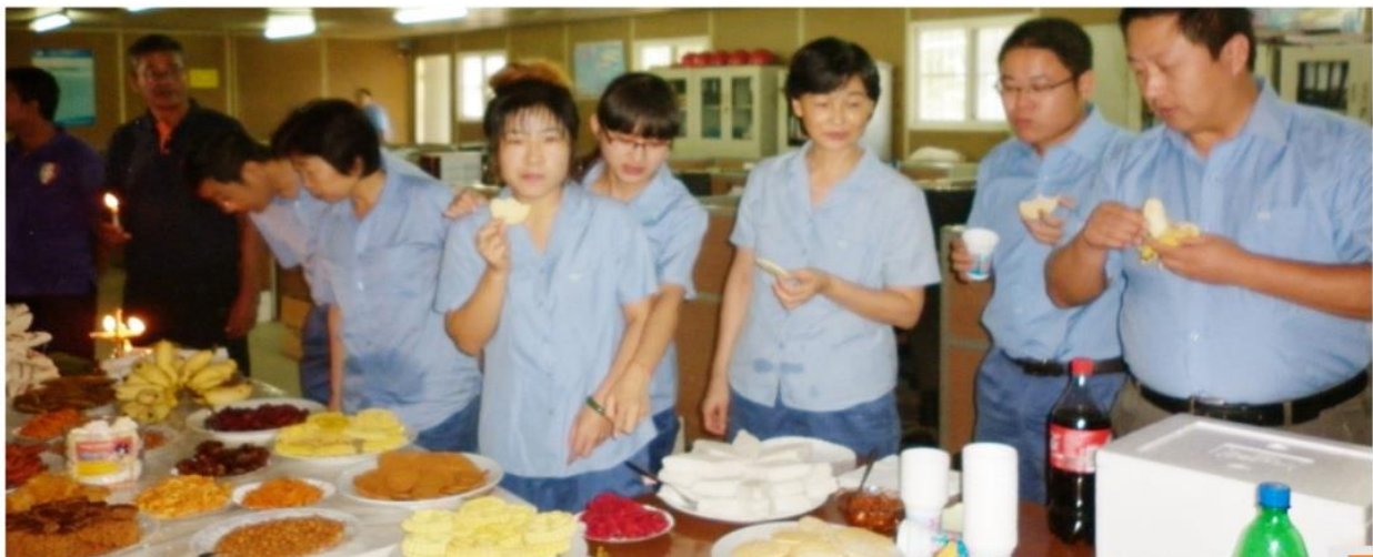
Celebrating New Year With MCC Staff Members