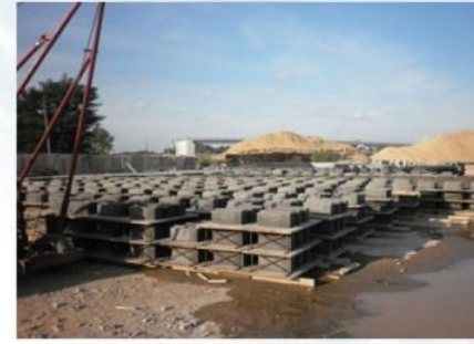
Masonry Block Yard (MCC)